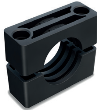
Correspondence between the DIN 3015-2 group and the DCE-H group